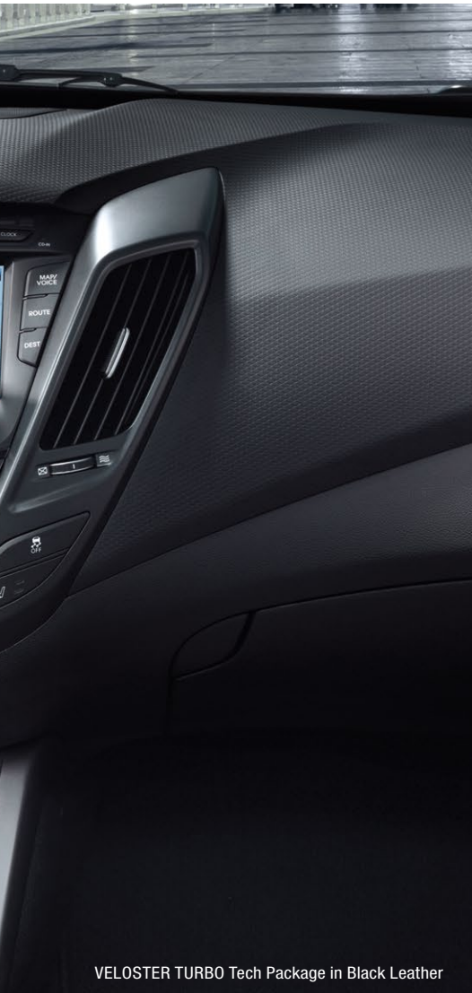
VELOSTER TURBO Tech Package in Black Leather