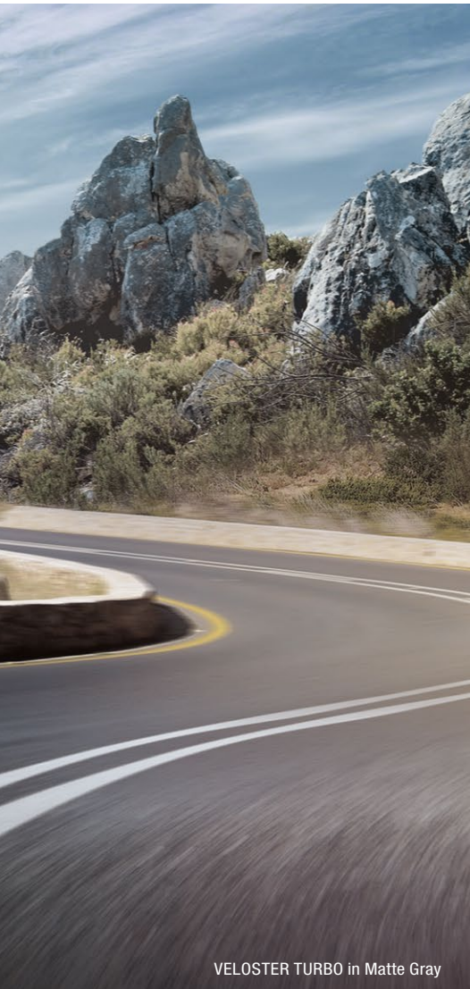
VELOSTER TURBO in Matte Gray